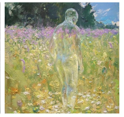
About the theme: Unfiltered voices: Hustle culture and moonlighting-

The youth are amplifying their voices towards challenges of the current times and are combating overwhelming feelings, burnouts or jugging the work life balance from hustles or side gigs. Is 9 to 5 still not enough? To deconstruct the political system and realize "why are we here?